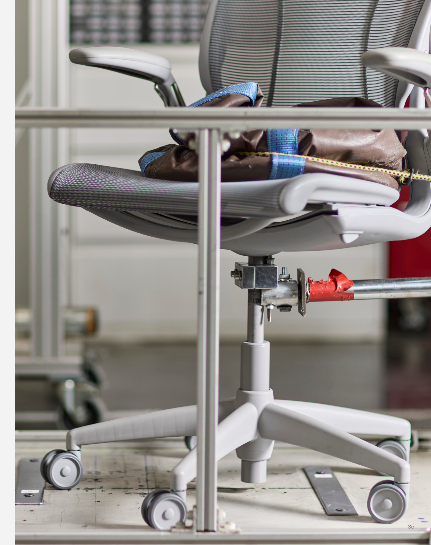
Duron arm pads