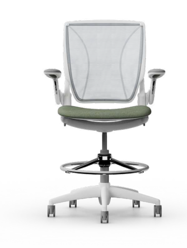
World High Task - Mesh