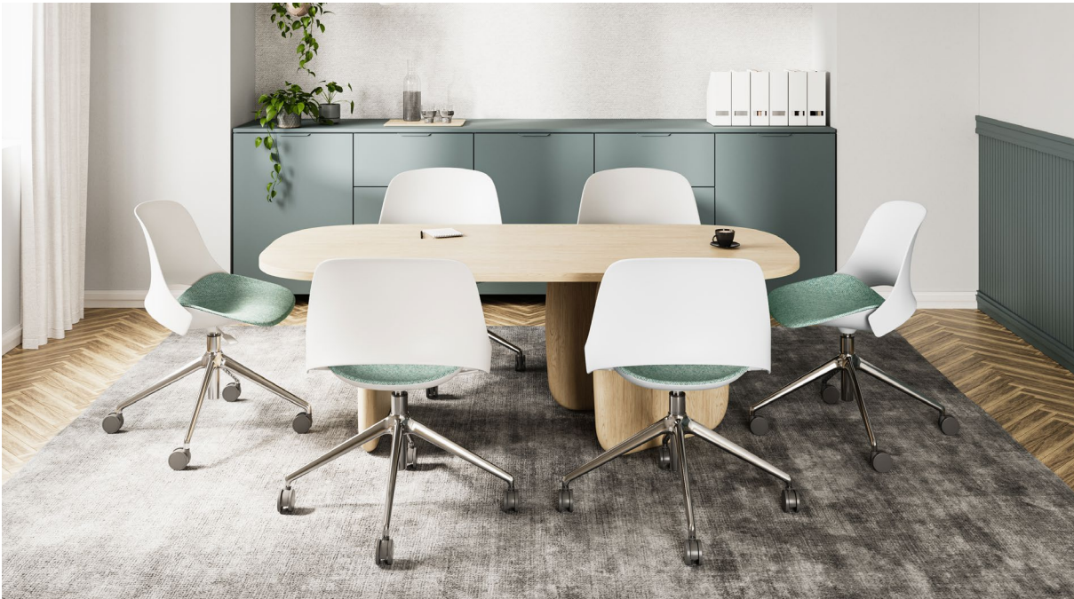
Trea Lite Task, Vanir 0913

Minimalist design lends true versatility without sacrificing comfort, style, or first-class functionality.