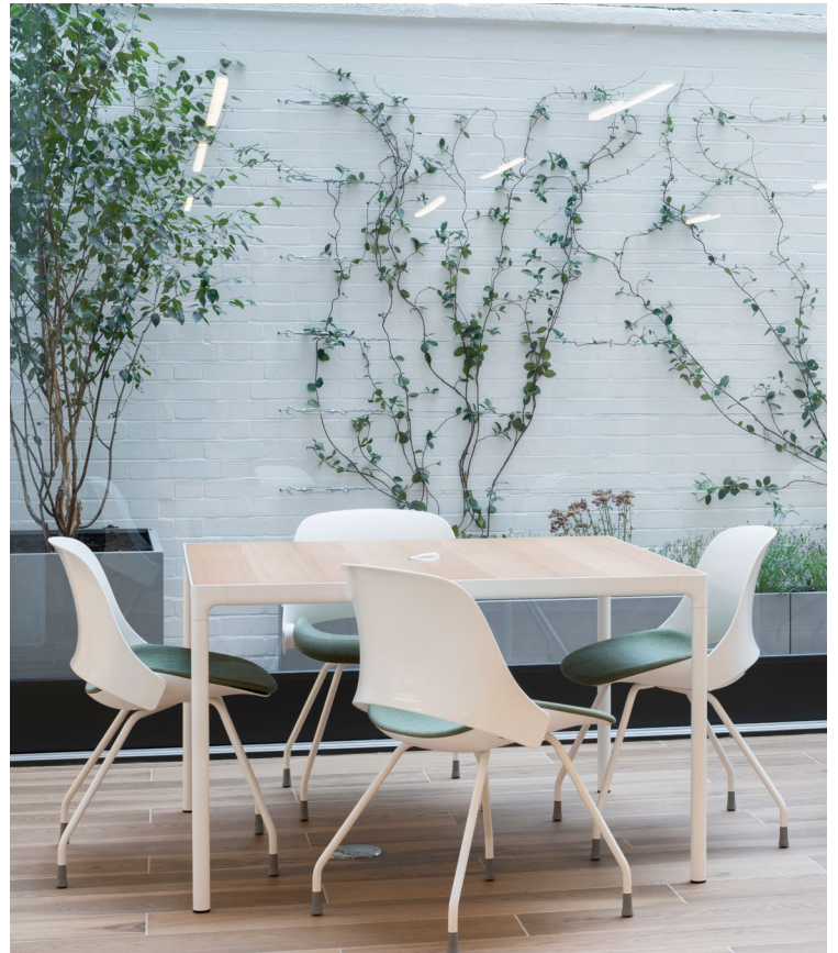
Trea Four Leg, Remix 0906

Ideally suited to a wide range of work environments, Trea brings new lightweight language to high-function design. Its clean, minimalist aesthetic elevates any setting without pulling focus, while the powerful, ergonomic mechanics as its core are instantly felt but never seen.