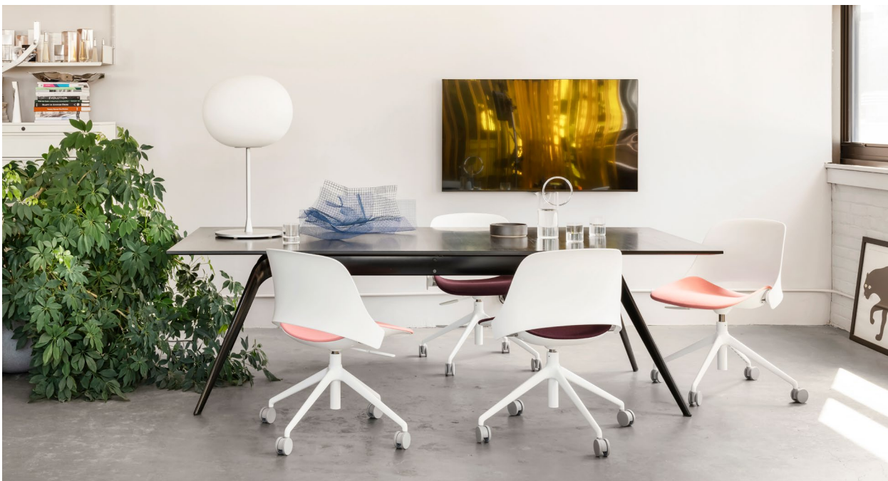
Trea Lite Task, Steelcut Quartet 0534 and 0684