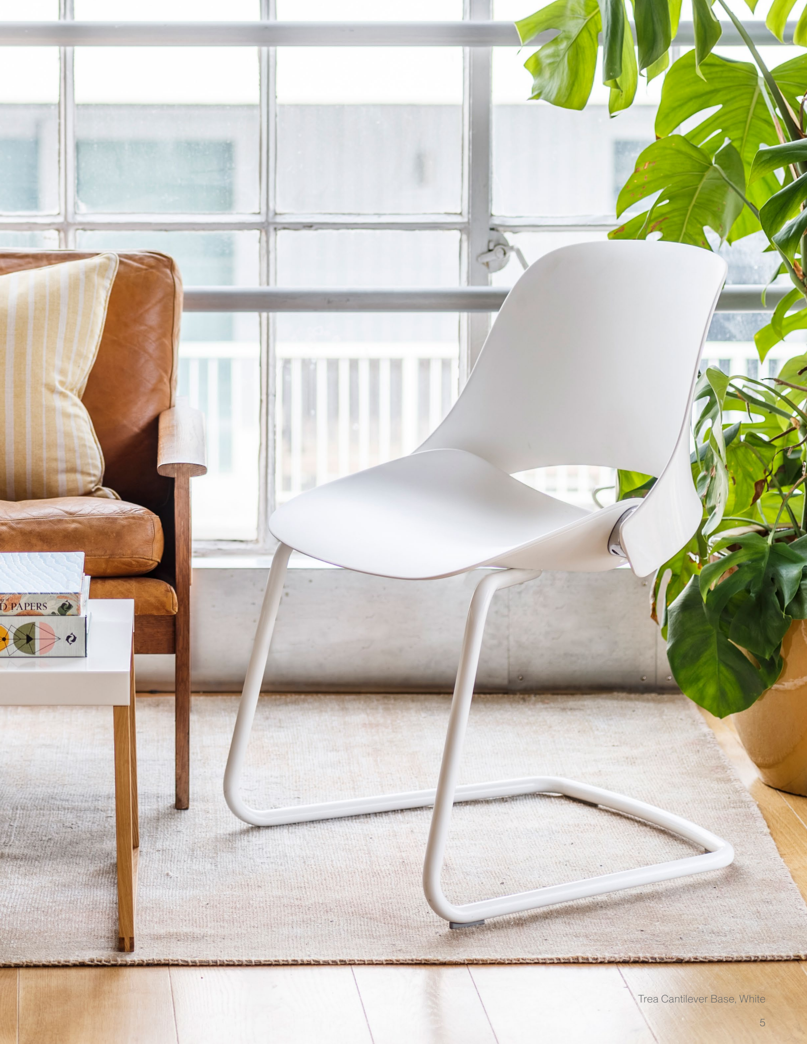
Treca Cantilever Base, White