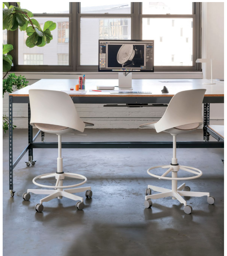
Trea Lite Task Stool, Arda 0201

Minimalist design lends true versatility without sacrificing comfort, style, or first-class functionality.